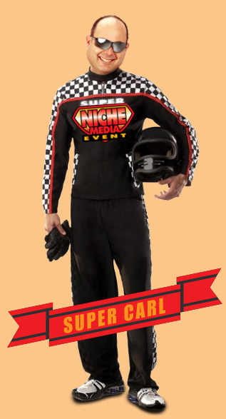
2017 theme = NASCAR Sponsor logo on